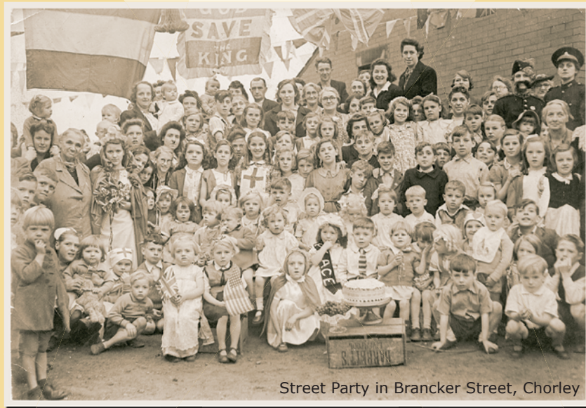
Street Party in Brancker Street, Chorley

MEMORIES OF SCHOOLDAYS IN THE SECOND WORLD WAR IN CHORLEY AND DISTRICT